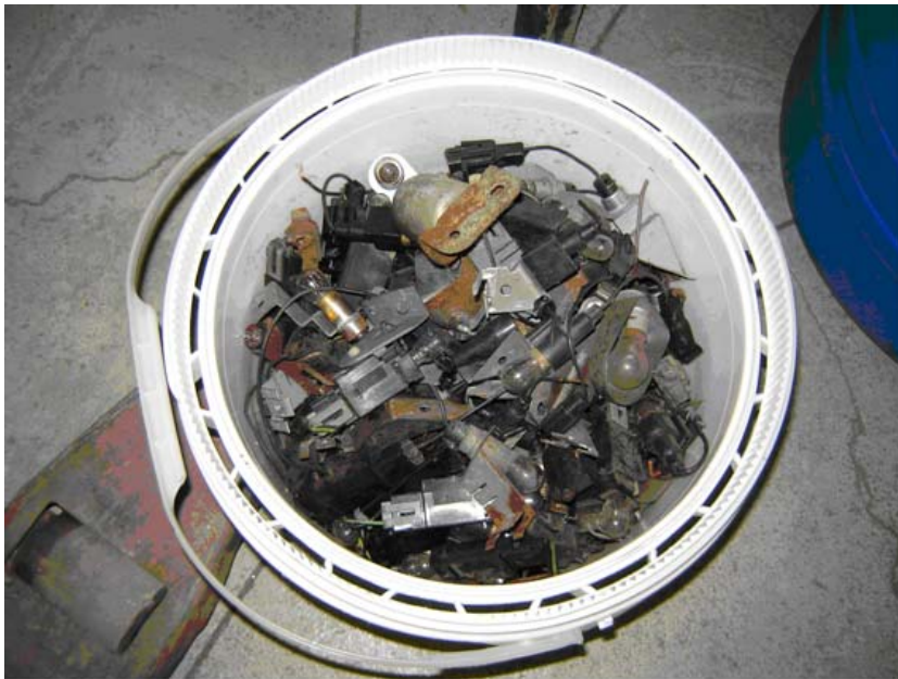
3.5 Gallon Bucket of Assemblies